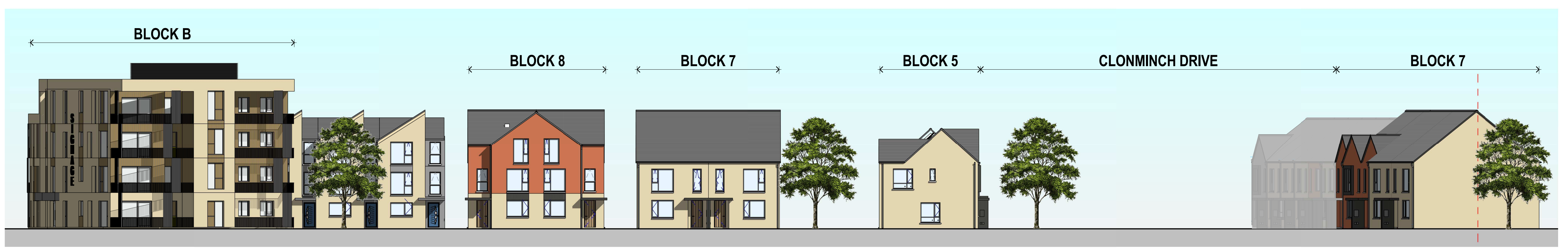
3 Clonminch Drive (East) Part 01 1 : 200