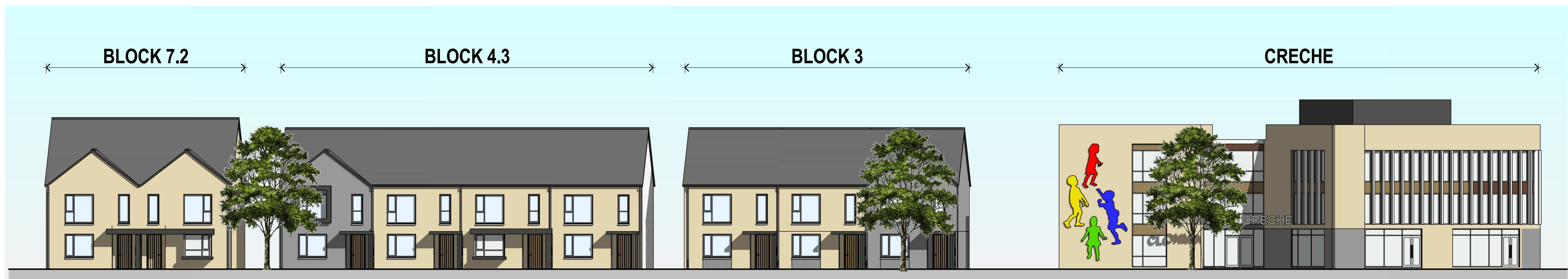
4 .Clonminch Drive (West) Part 01 1 : 200

CPR Note: All works to be carried out using proper materials which are fit for the use they are intended and for the condition in which they are to be used. All materials used in connection with the works to comply with the Construction Products Regulation (EU) No. 305/2011 and the harmonised technical specification/standards that fall within the remit of the CPR No. 305/2011